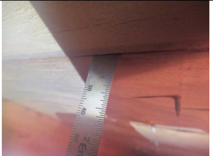
Roof deck thickness