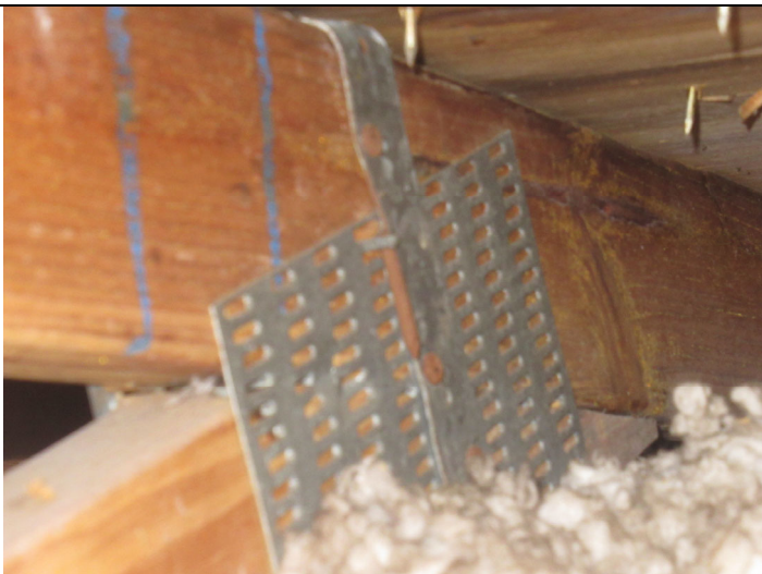
Roof to wall attachment