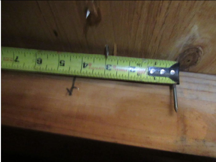
Roof deck attachment