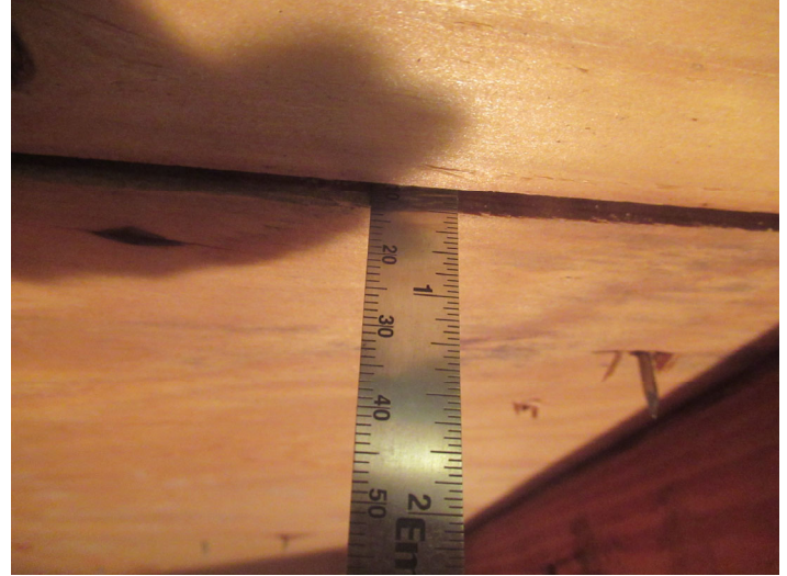
Roof deck thickness

Record PER-H-CB18-09819: Building Combo Permit Record Status: Finaled