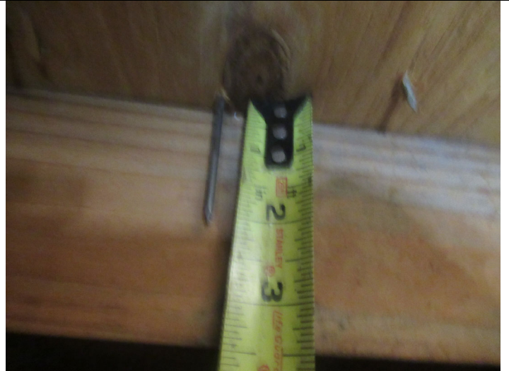
Roof deck attachment