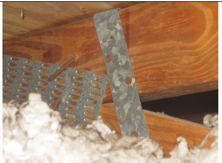
Roof to wall attachment