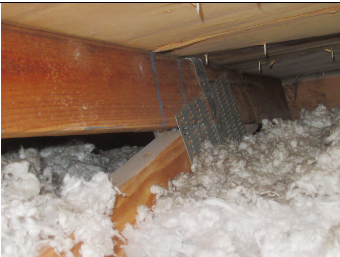
Roof to wall attachment