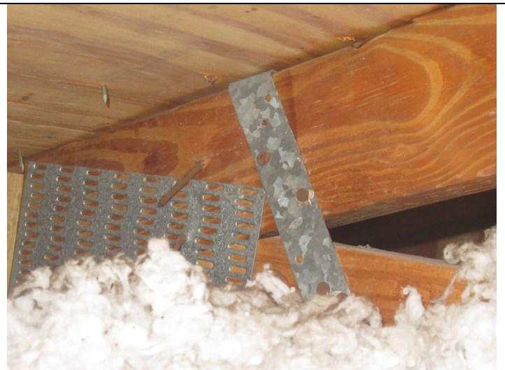
Roof to wall attachment