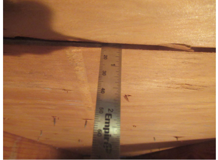
Roof deck thickness

Record EBP-21-10796: Express Building Permit Record Status: Finaled