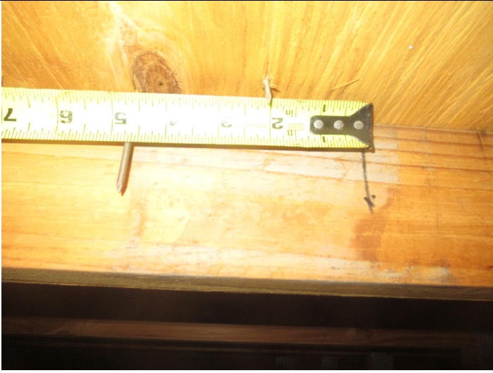
Roof deck attachment