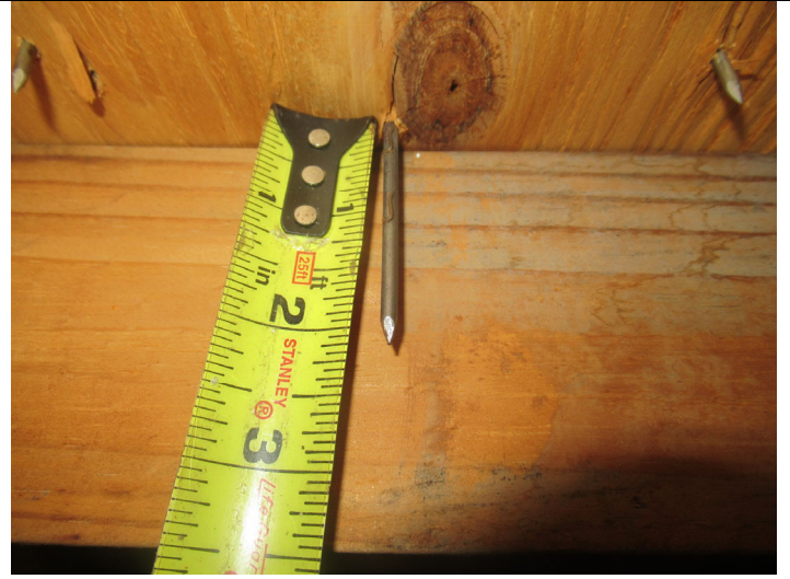
Roof deck attachment